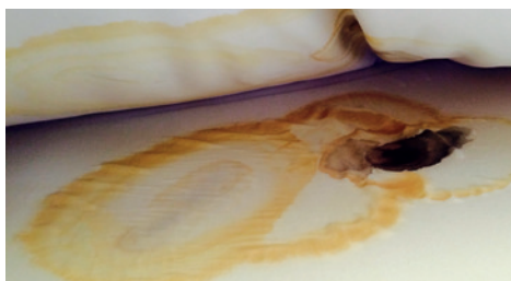
Contamination of foam as a result of strike-through in mattress cover

The team will inspect all covers, foam and insert materials for wear and strike-through, which occurs when bodily fluids penetrate the outer cover of the product resulting in contamination.